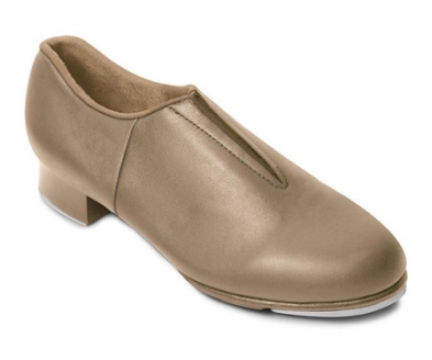
Tan Slip On Tap Shoes